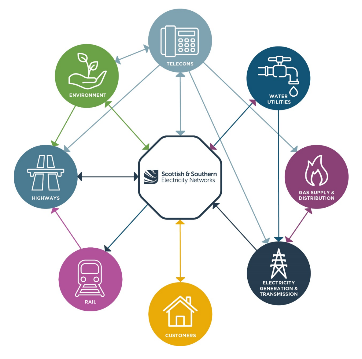
Figure 4 – Interdependency map of SSEN Distribution's key stakeholders

We have identified a number of key areas of interdependencies and provide an overview of where the dependencies exists below. We will commit to further investigate and analyse our interdependencies to develop a better understanding of the impacts of climate change on our business.